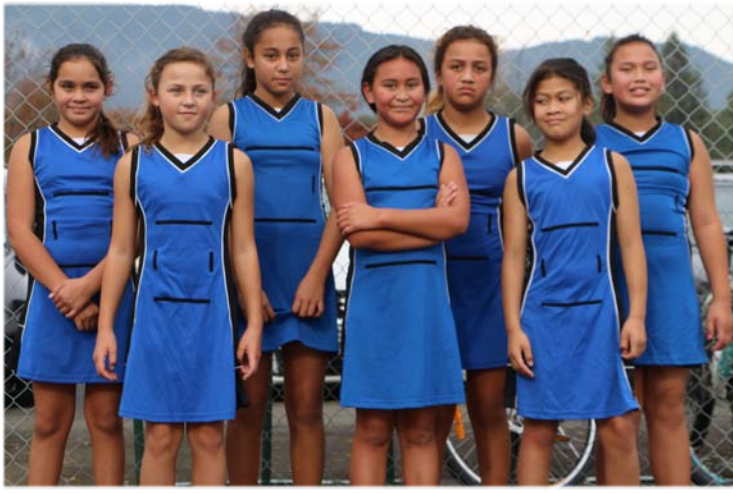
Victory's Y5-6 Netball team after their first game & a strong win on Saturday, awesome effort!